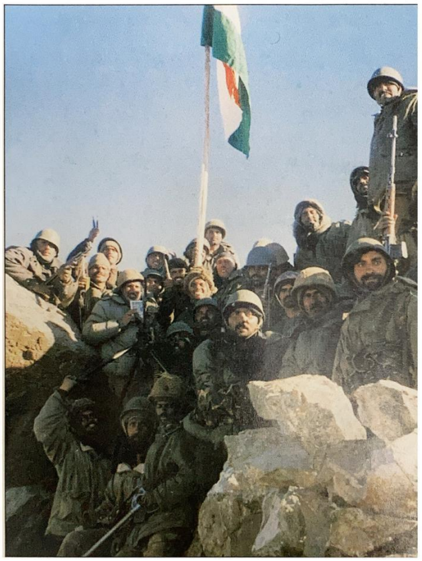
Victory! on Tiger Hill Top